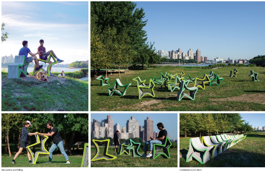
Figure 2. Completed installation.