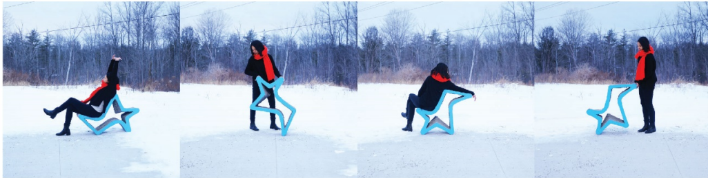
RRRolling Stones _ Transforming Public Interactions and Urban Environments Through Technology

in the concrete profiles. Despite appearances, this is not a cookie-cutter design! While sectional profiles reference archetypes of chairs, seats, and lounge chairs, the layered fabrication process creates a comfortable textured seating surface. Through its ability to reconfigure, the RRRolling Stones project promotes playful novel forms of public design participation, enabled by the use and adaptation of new construction technology. The 3D printing method offers a path towards a sustainable concrete architecture, requiring no formwork for construction and significantly reducing waste material. RRRolling Stones provide a critical example of how technology can assist architects in combating the effects of climate change through the development of smart and sustainable construction techniques. In the process, new design opportunities emerge.